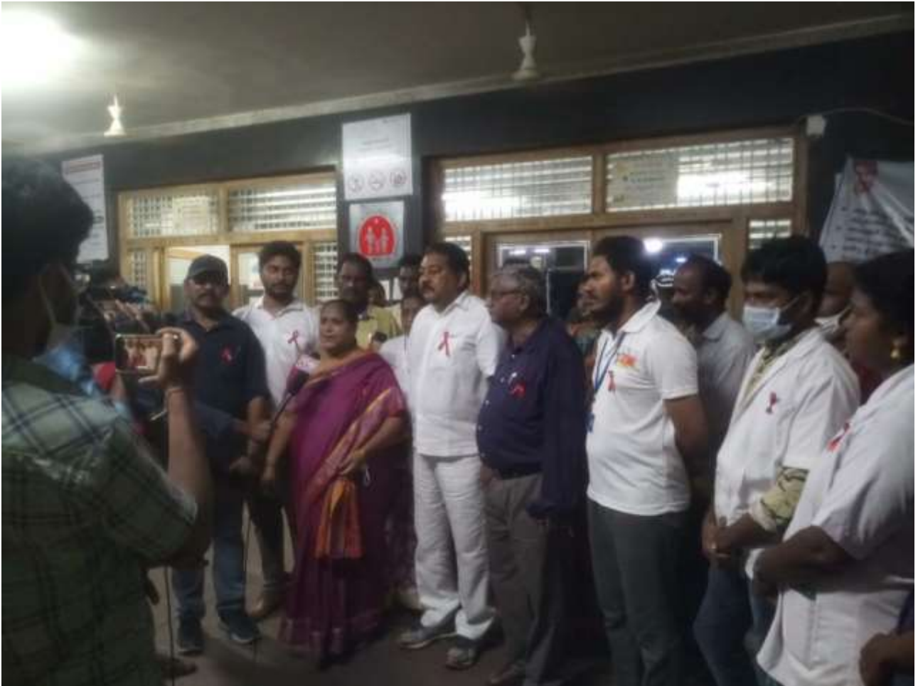
ADM &HO Madam conducted Press meet after completion of Rally on this day at Government Hospital, Eluru.