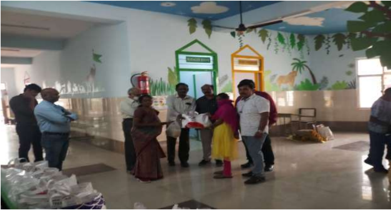
NUTRITION DISTRIBUTED AT ART CENTER IN ELURU ON 02-12-2022