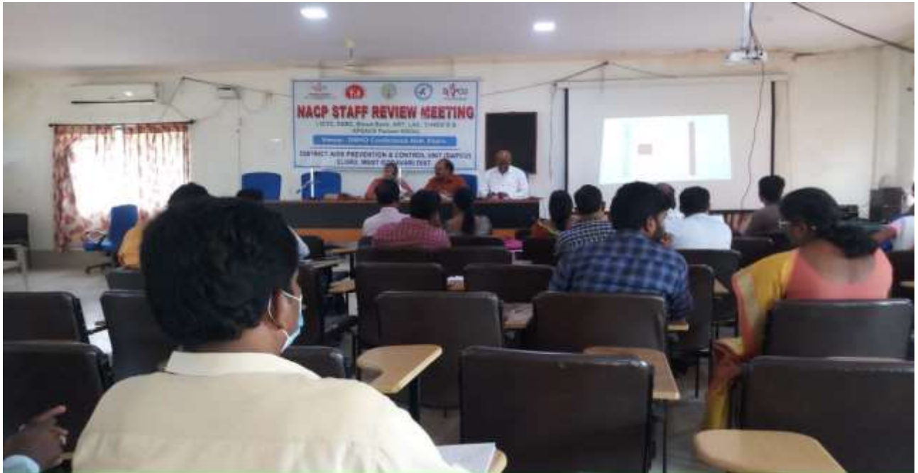
ICTC REVIEW MEETING IN ELURU DM HO OFFICE ON 23-01-2023