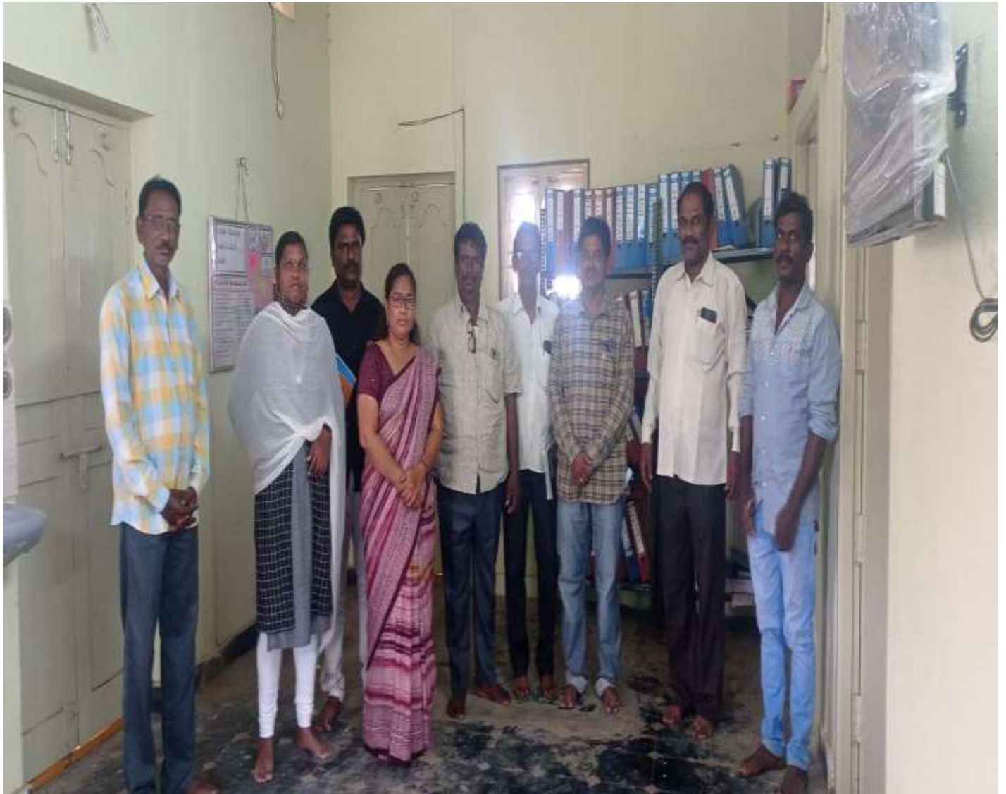
MONTHLY REVIEW MEETING PHOTOS IN APPLE CSC OFFICE, ELURU