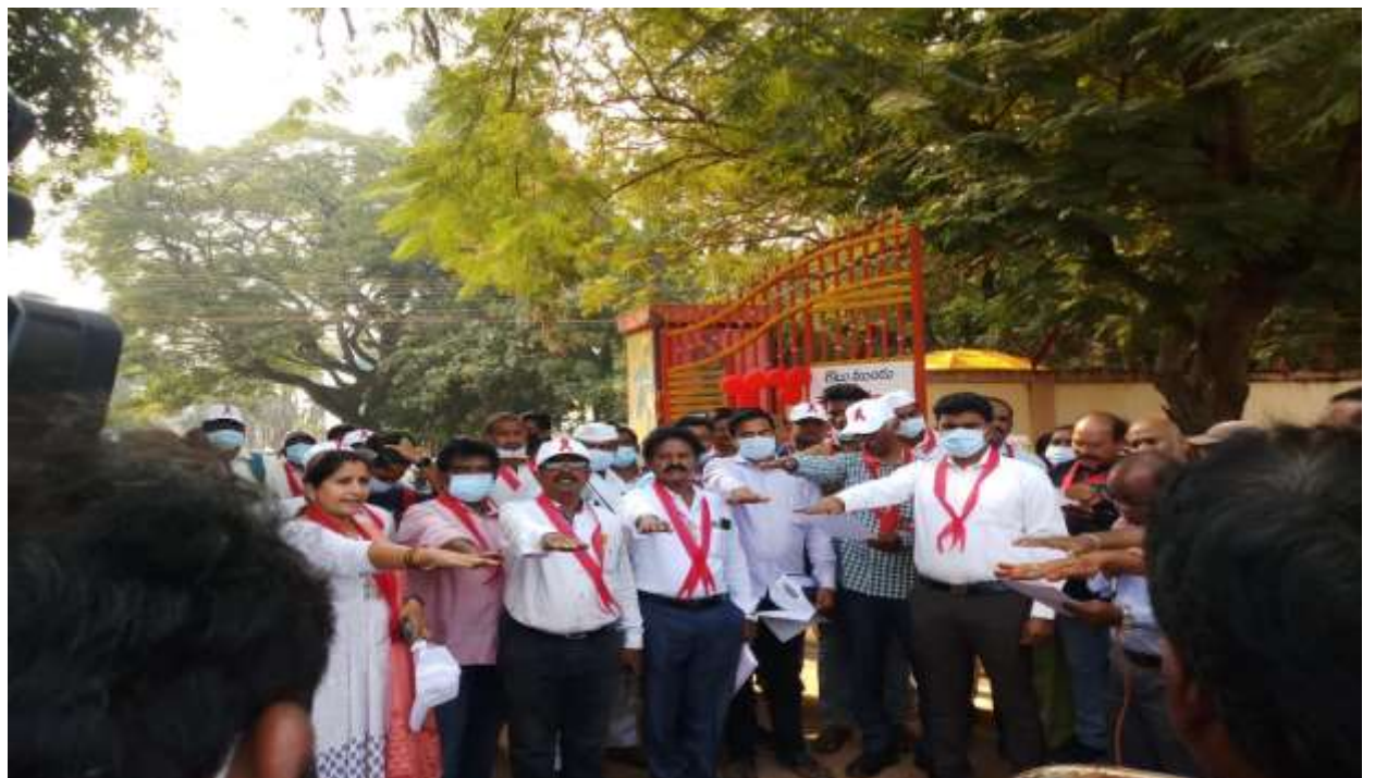
PLEDGE AT INDOOR STADIUM WITH ALL PARTICIPATED MEMBERS