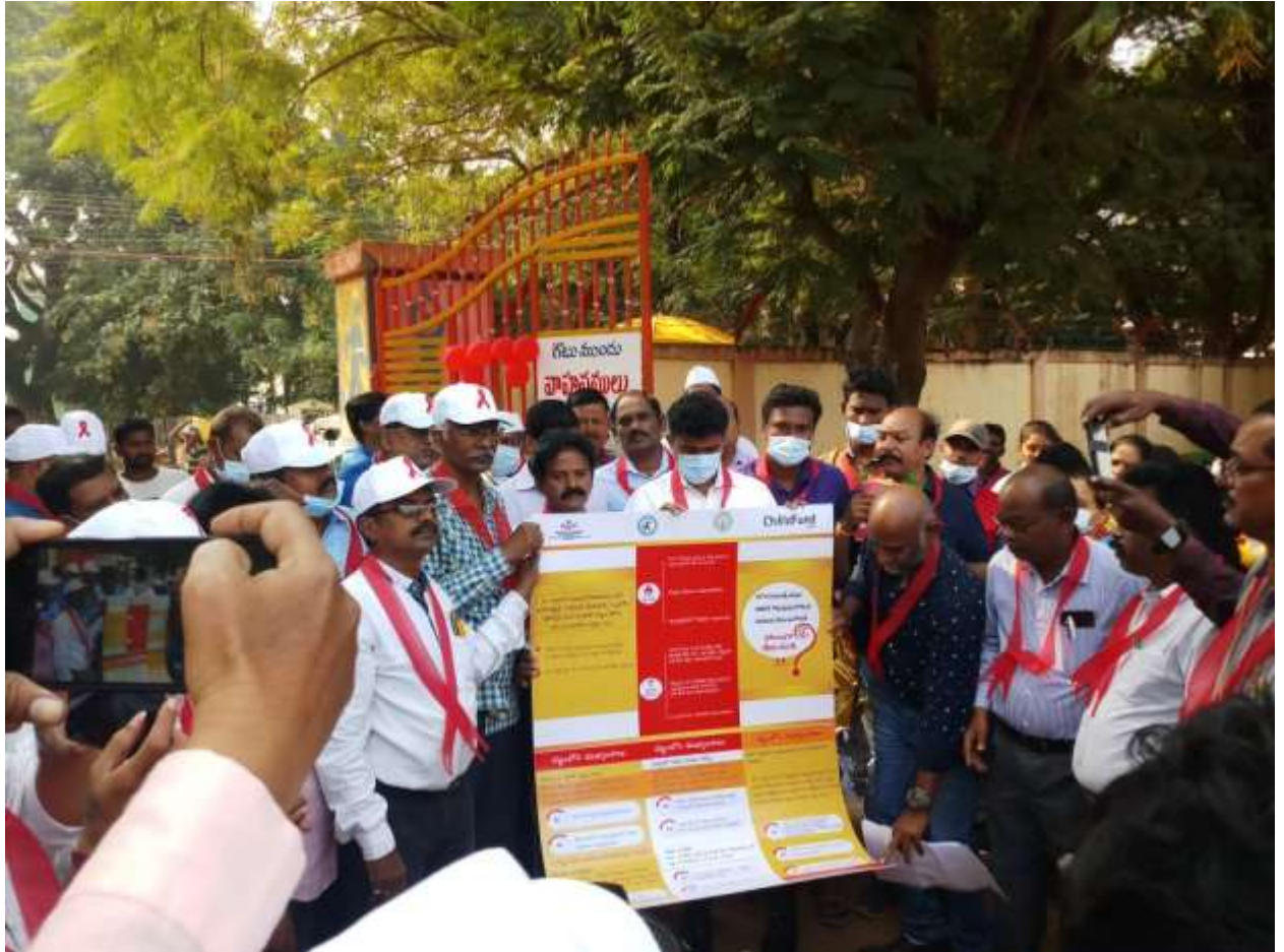
Joint Collector, DM HO, ADM HO, DPM, DIS, APPLE CSC PD and other NGO's Partners at Indoor Stadium