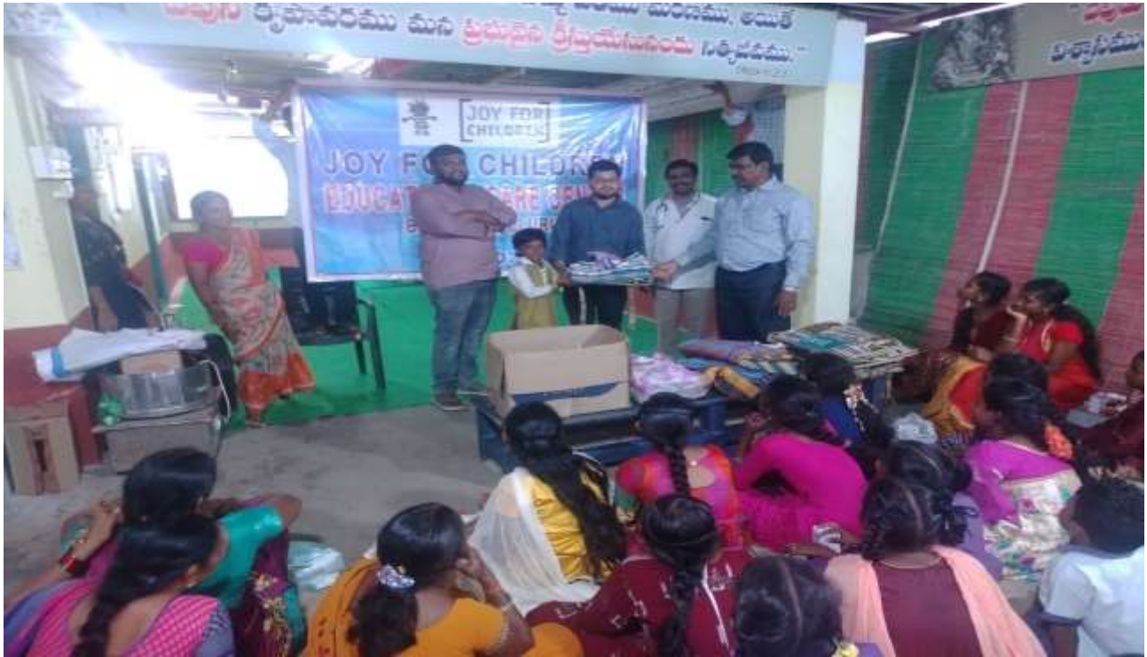
AT HEALTH CAMP DISTRIBUTED CLOTHS AND NUTRITION SUPPORT BY DONORS