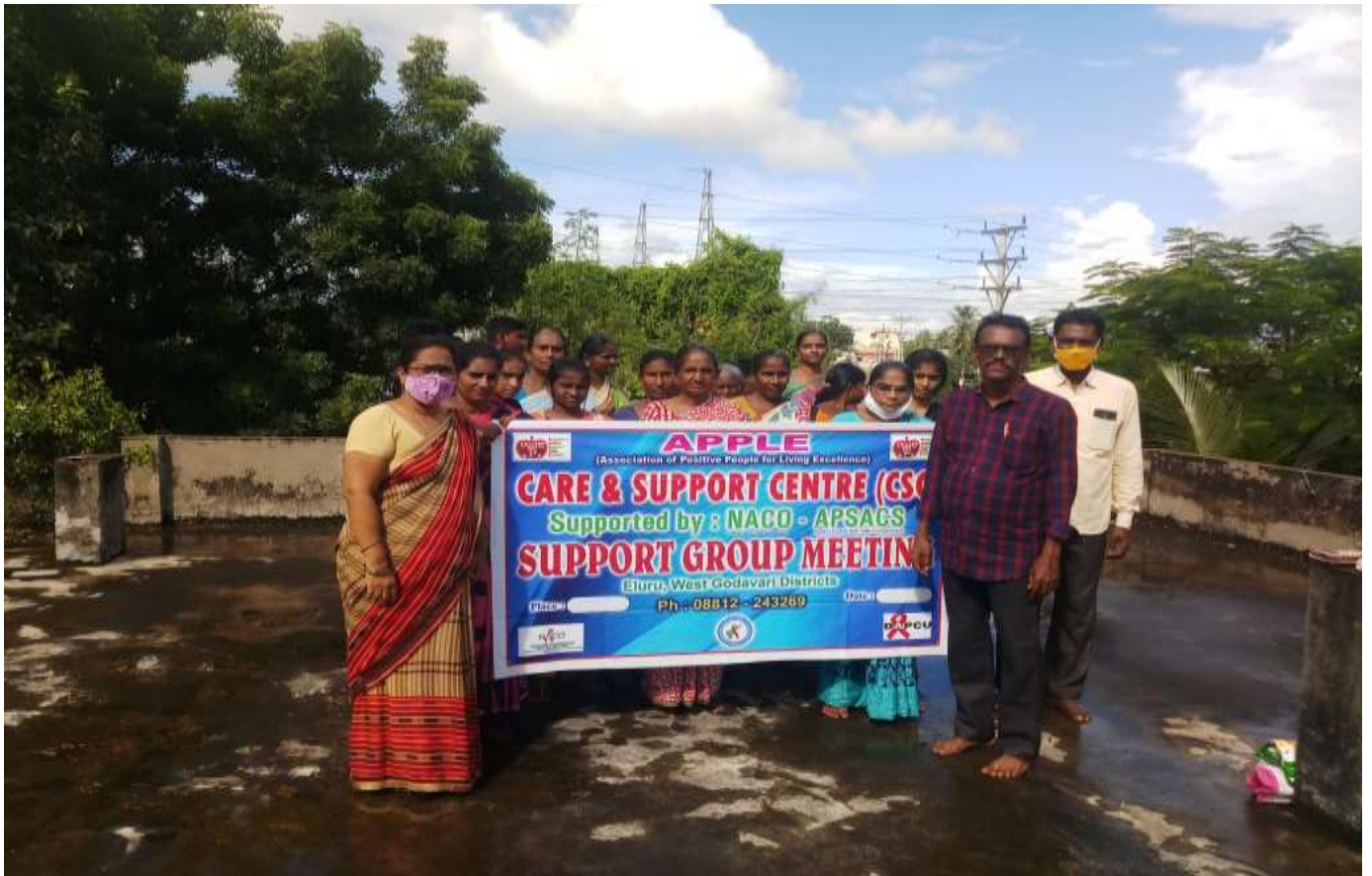
APPLE CSC ORW-01 CONDUCTED SUPPORT GROUP MEETING IN ELURU WITH CLIENTS