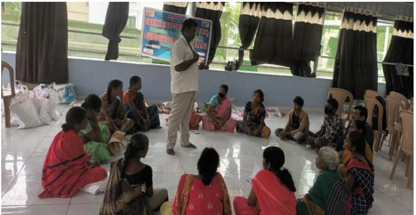
SUPPORT GROUP MEETING IN BHIMAVARAM UNDER ORW 04 OF K. SRINIVASARAO