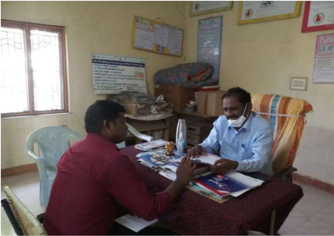
APPLE CSC PD TALKED WITH ALLIANCE TECHNICAL COORDINATOR ON 29-06-2022 IN APPLE OFFICE