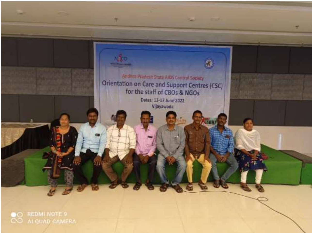
APPLE CSC STAFF IN VIJAYAWADA FOR ORIENTATION TRAINING FOR ALL CSC'S UNDER APSACS FROM 13 TO 15 JUNE 2022