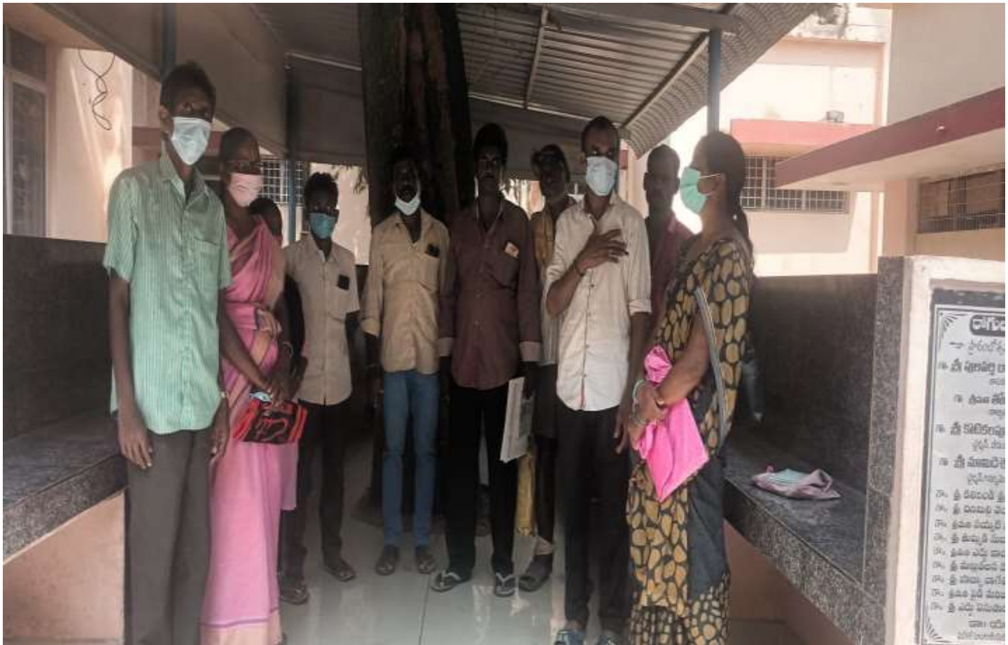
SUPPORT GROUP MEETING IN NARASAPURAM