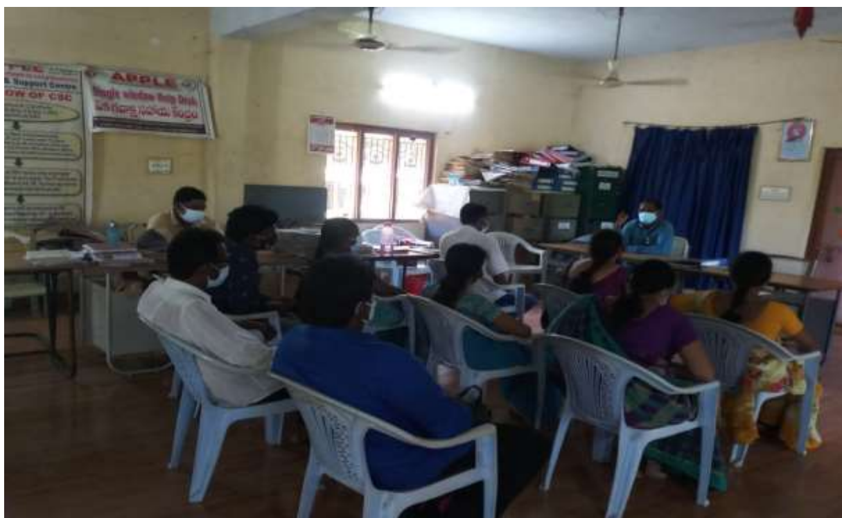
WEEKLY REVIEW MEETING PHOTO AT APPLE VIHAAN CSC, ELURU

And moreover, in the meeting we had taken data from all staff those who have done the activity for this week and then also given suggestions for them to do the work in better way. And discussing & planning on program activities like Support Group Meeting and Advocacy Meeting (Once in a Quarter), for Local Resource Mobilization to follow up Local Donors and also taking registration data from the staff to update in the website of Client Management and Information System.