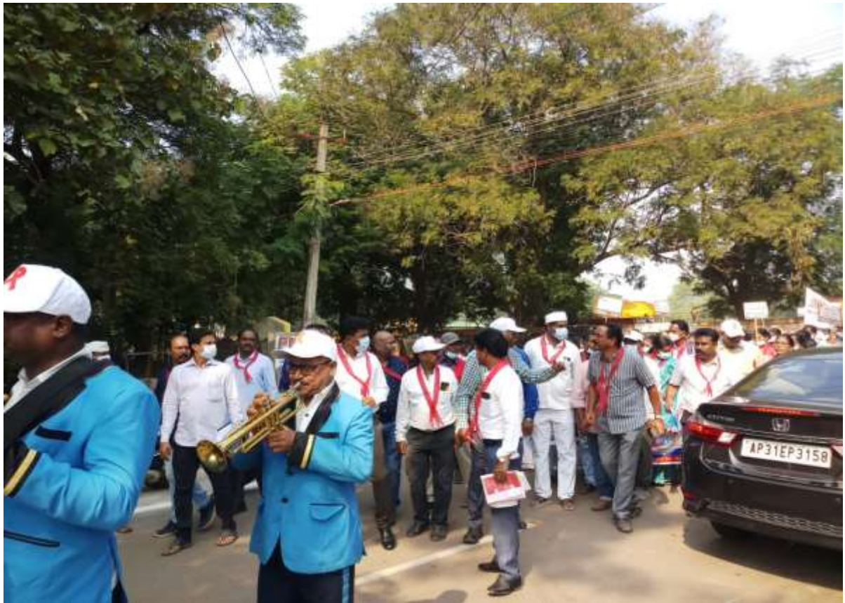
Participated all members in Rally continued from Indoor stadium to Fire station center on this day