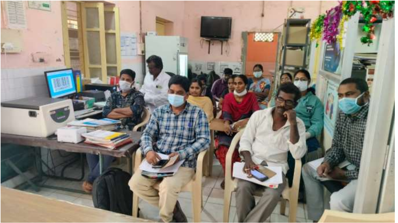
ART CSC COORDINATION MEETING IN BHIMAVARAM ART CENTRE