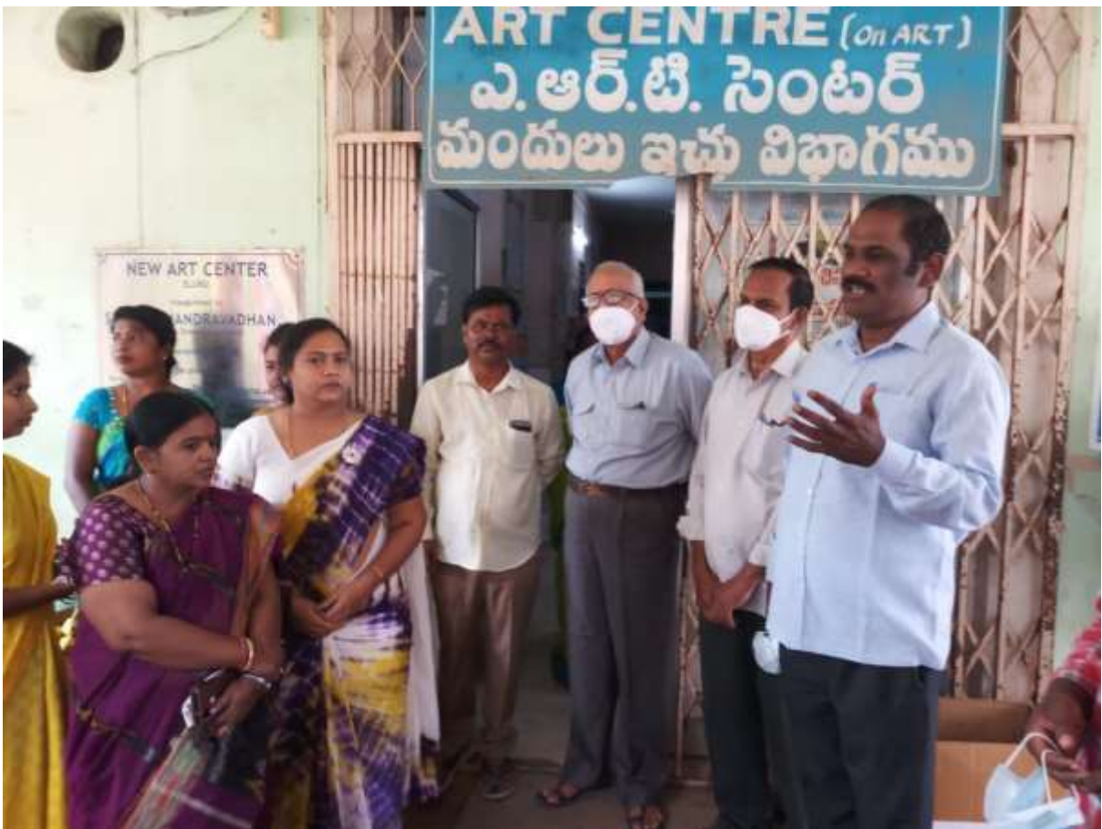
FRUITS DISTRIBUTION AT ART CENTER ELURU ON 02-12-2022