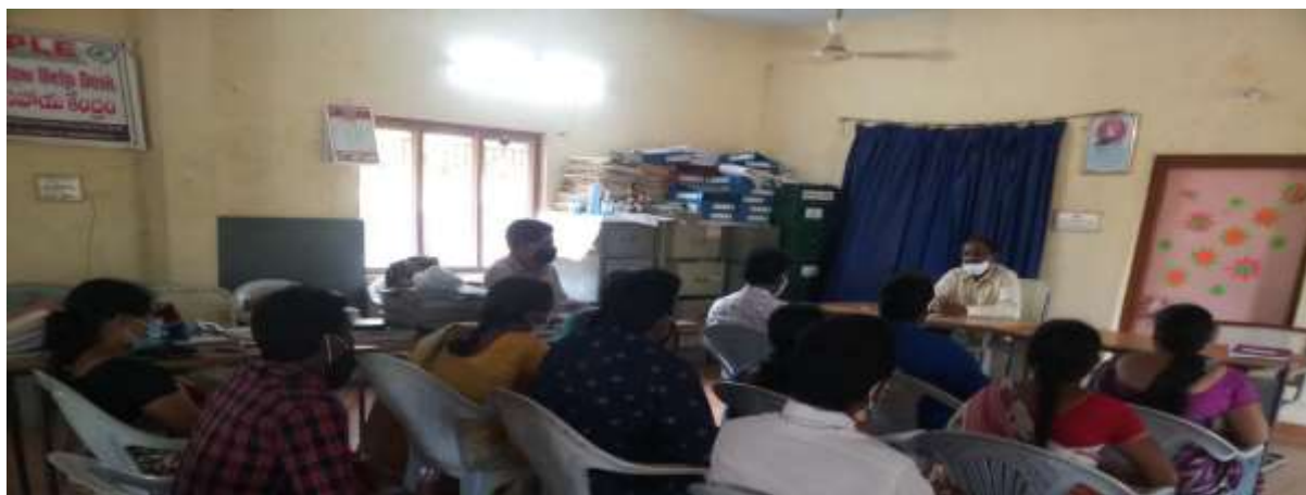
MONTHLY REVIEW MEETING IN APPLE VIHAAN CSC, ELURU

Particularly in the month of March we have conduct Review Meeting on 25th due to SR instructions because of Program ending of this month. So that they said that all activities are complete the end of the month and moreover given 3 months transition period for all CSC's. We have reached all activities and updated in the CMIS (Client Management and Information System). As well as we have updated in the input module regarding outreach data like section H, J & K by outreach wise. We have taken all diaries, lfu's line lists, follow up formats and common format for newly initiated and 80% ART Adherence cases from all outreach staff, before that we have collected the all Tabs from our staff and secure in the office as per Vihaan staff level instructions.