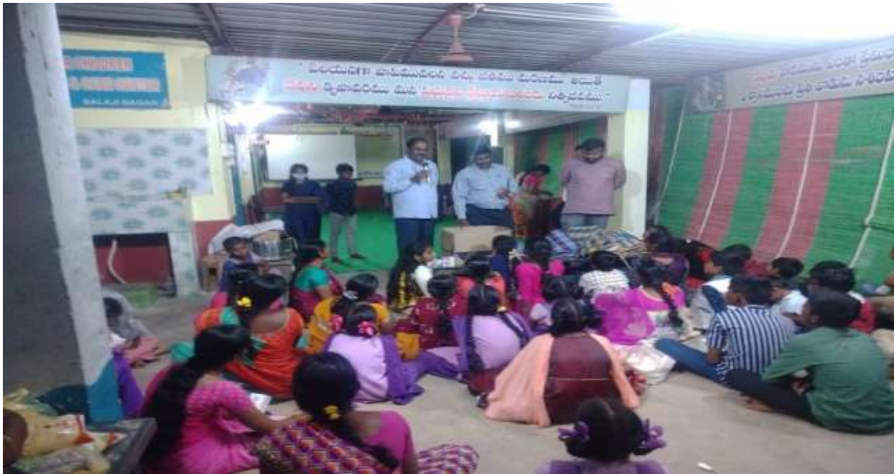
APPLE PD TALKED WITH CLIENTS AT BALAJI NAGAR HEALTH CAMP ON 24-11-2022