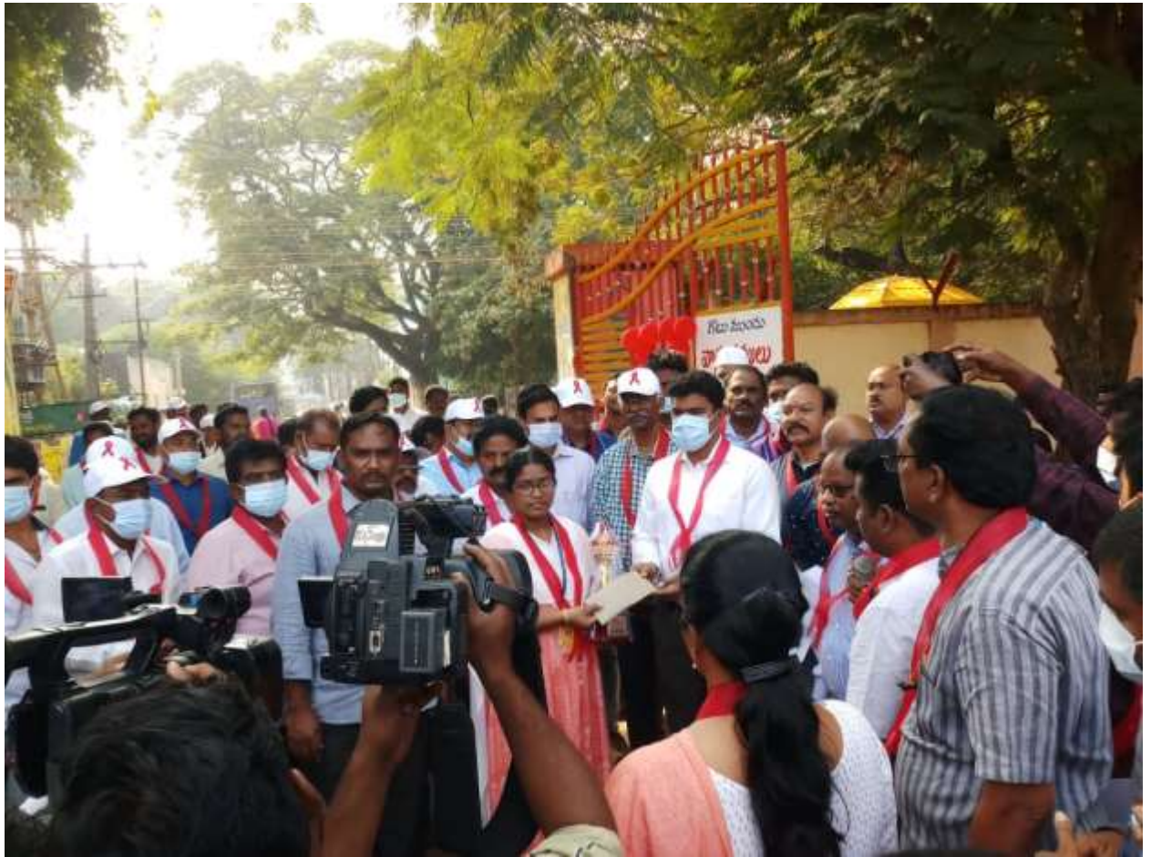
Joint Collector conducted Press Meet at Indoor Stadium Out gate in Eluru.