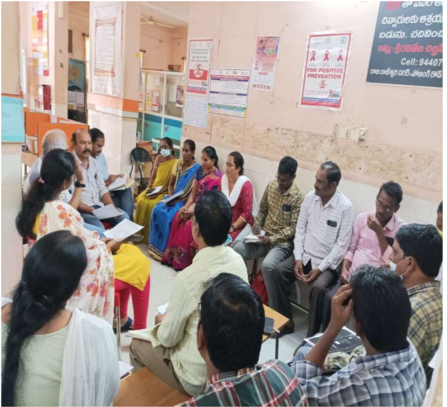
ART CSC COORDINATION MEETING IN ELURU ART CENTRE