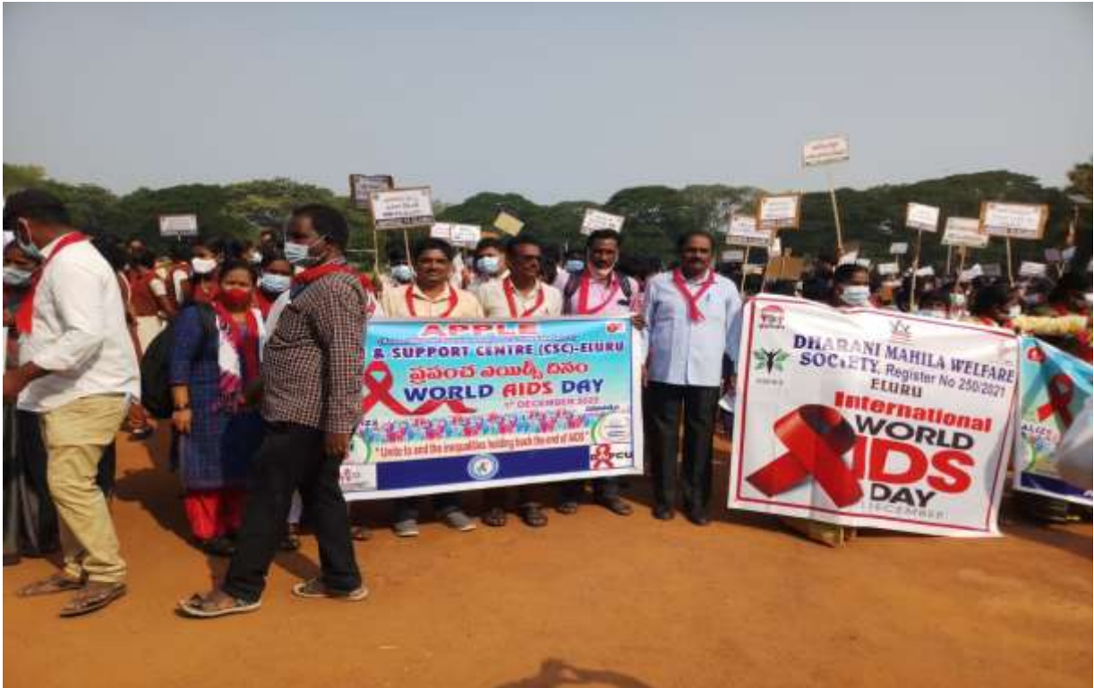
APPLE CSC STAFF PARTICIPATED IN WORLD AIDS DAY CELEBRATIONS IN INDOOR STADIUM, ELURU ON 1ST DECEMBER 2022